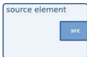
Figure 5-1. Visualisation of a source element

Source elements do not accept data, they only generate data. You can see this in the figure because it only has a source pad (on the right). A source pad can only generate data.