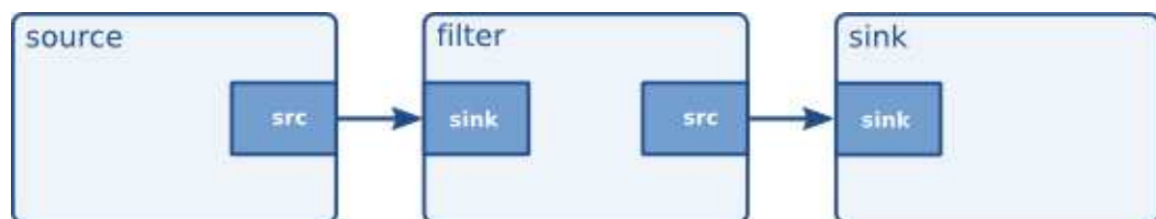
Figure 5-5. Visualisation of three linked elements

By linking these three elements, we have created a very simple chain of elements. The effect of this will be that the output of the source element (“element1”) will be used as input for the filter-like element (“element2”). The filter-like element will do something with the data and send the result to the final sink element (“element3”).